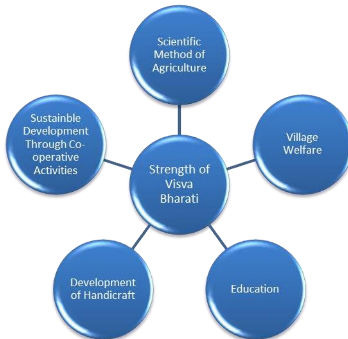
Strength of Visva-Bharati

The agricultural activities were based on three phases- (i) experiment; (ii) training, and (iii) extension. Extension activities were given much priority